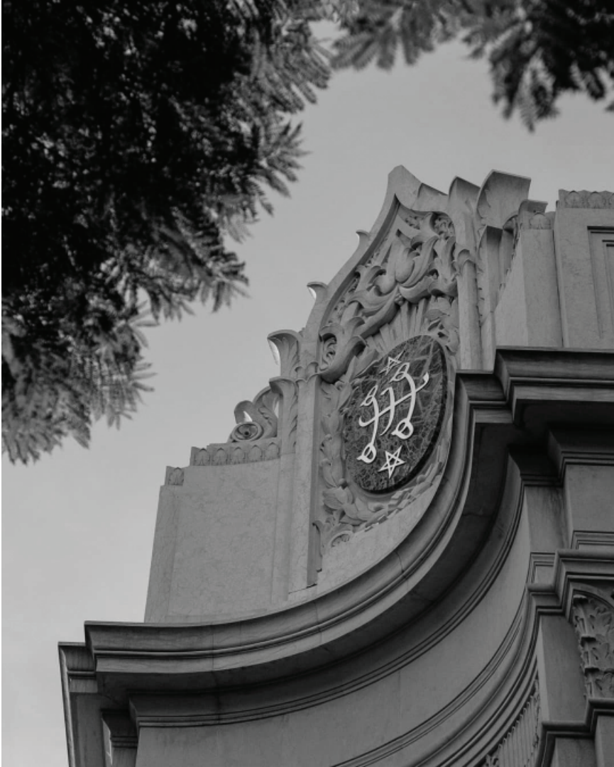
Crest – Shrine of the Báb