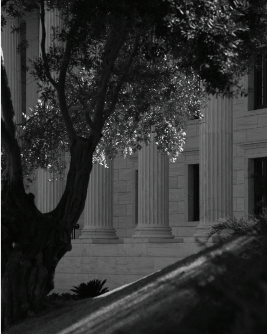
Pillars – Seat of the Universal House of Justice