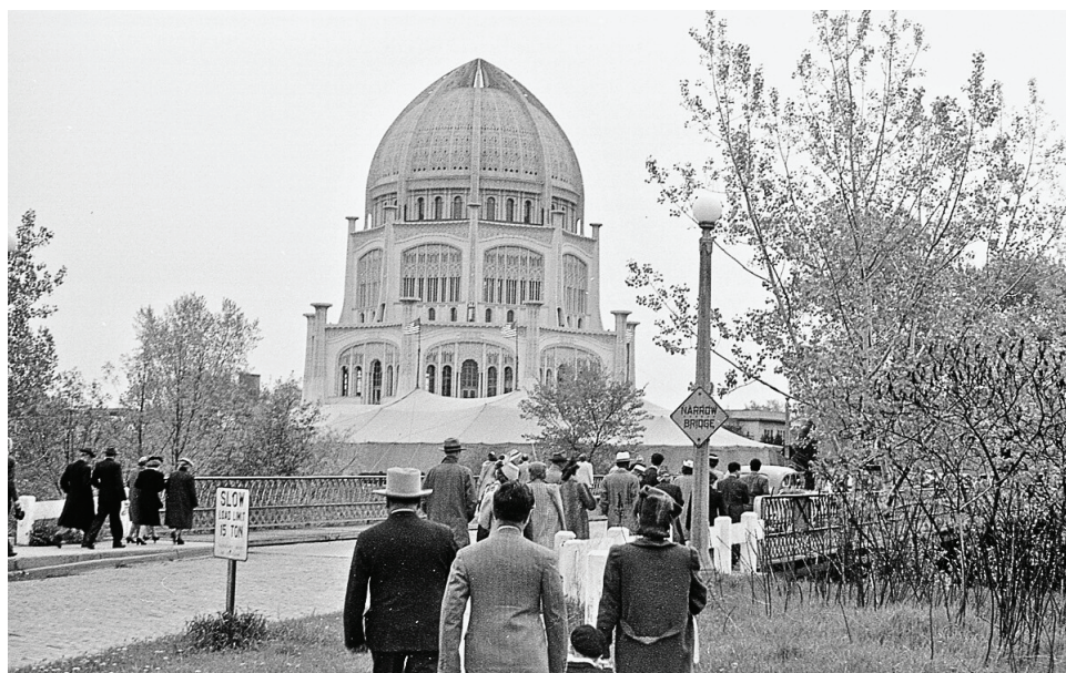
1945, Delegates attending the National Convention, Bahá'í House of Worship in Wilmette, Illinois