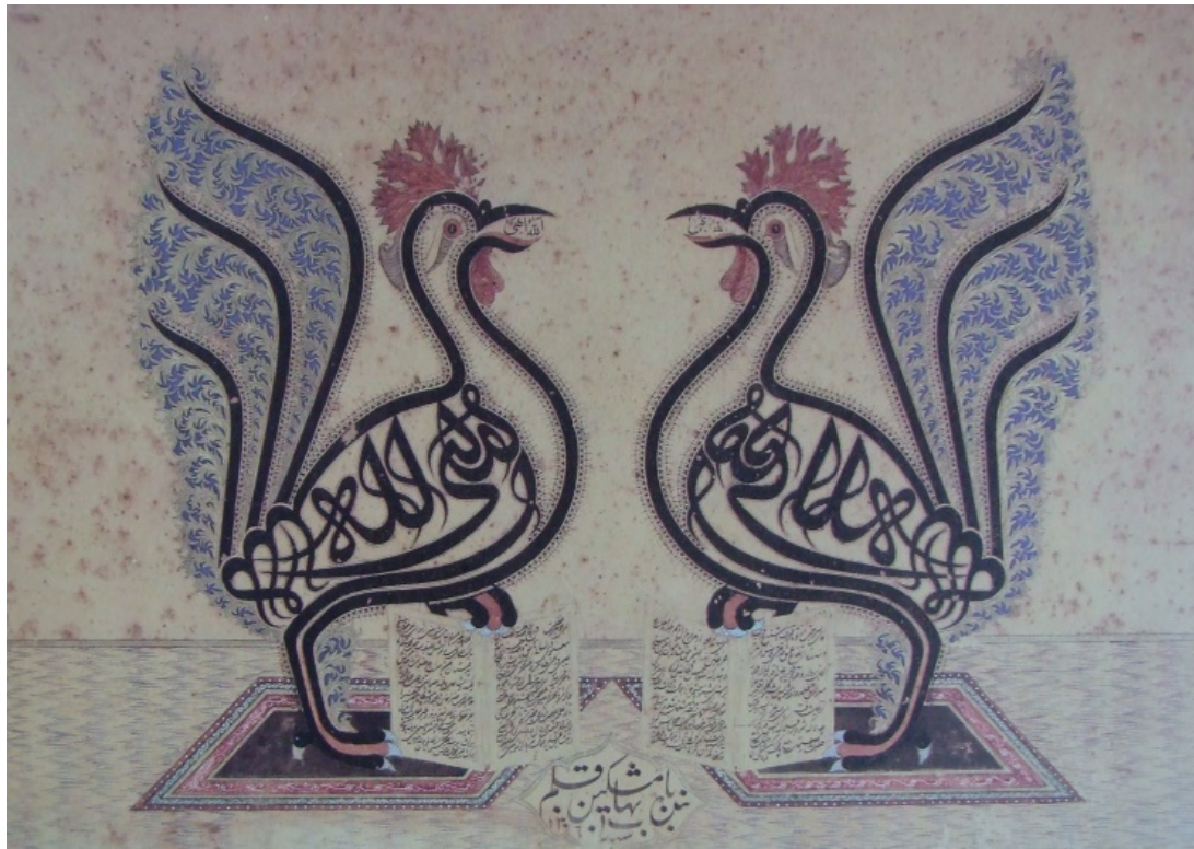
Figure 7. Composition with double birds and books open to pages from The Hidden Words of Bahá'u'lláh .