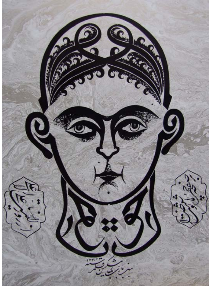
Figure 11. Calligraphic design in the shape of a human face. By Mishkín-Qalam, 1890.

their writings more accessible to those trained in the ancient traditions. The Ḥurúfis themselves placed so much emphasis on the sacred nature of letters and numbers that, for them, all of the letters and their numerical values represented the total of all the emanating and creative possibilities of God and were indeed, God Himself made manifest (Schimmel, Islamic Culture 106). Thus the Arabic letters were the archetypes for the entire cosmos (Bausani, “Mystical Language” 234). It was the Ḥurúfí belief that this divine writing appeared in creation in the faces of humanity itself and that the features of the human physiognomy were reminiscent of the shapes of various letters: