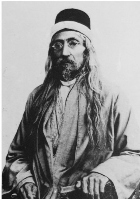
Figure 1. Photograph of Mishkín-Qalam.

This article will explore the calligraphy of Áqá Ḥusayn-i-Iṣfahání, better known by the honorific title, Mishkín-Qalam, or “the musk-scented pen” (figure 1). Although trained in the Islamic tradition of the calligraphic arts and capable of attaining a high station at the Persian court of Násiri'd-Dín Shah, Mishkín-Qalam chose to use his artistic talents for service to the Bahá'í Faith, a choice that caused an unprecedented transformation both in his calligraphy and in his life.