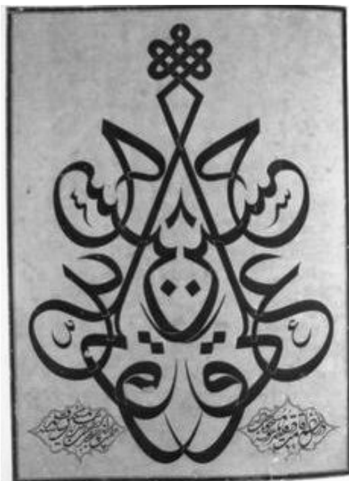
Figure 5. Calligraphic design with the name of Ḥusayn-'Alí in the "mirror style." Created by Mishkín-Qalam in 1877 while in captivity in Famagusta.

calligraphy remain to us from this period. The piece illustrated in figure 5 dates from 1877, and the inscription states that it was done in the ninth year of Mishkín-Qalam's captivity. The calligraphy is of the letters contained in the name Ḥusayn-'Alí, the given name of Bahá'u'lláh,