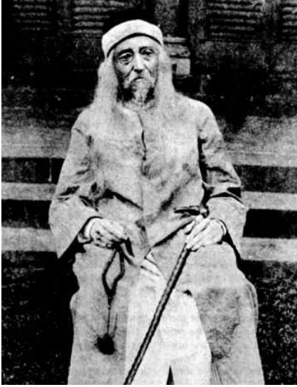
Figure 8. Photograph of Mishkín-Qalam.

A further description by the British authorities explains the reason for the imprisonment: