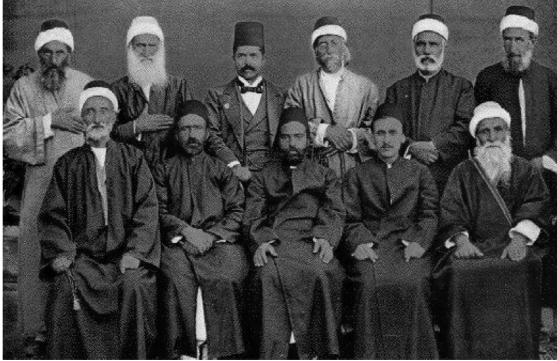
Figure 9. Mishkín-Qalam (top row, third from right) with the companions of Bahá'u'lláh in 'Akká.