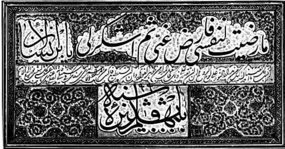
Figure 3. Verses from The Hidden Words of Baha'u'llah . The calligraphy is by Mishkín-Qalam and is in the nasta'liq , naskh , and shikastih styles. 1881—82. Reprinted from Balyuzi, Bahá'u'lláh: The King of Glory 161

According to the accounts of this event, Mishkín-Qalam did this portrait in a technique known as khatt-i-nakhún in which the image is engraved with a fingernail into the back of a sheet. This encounter ultimately led to an appointment for Áqá Ḥusayn-i-Işfahání as tutor to the Crown Prince. His work became known in the court, and Náşiri'd-Dín Sháh himself was said to have given the artist the title Mishkín-Qalam (Ishraq-Khávarí, Núrayn 72-83).