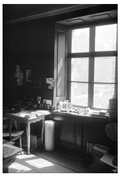
Tobey's home and studio Basel, Switzerland, 1976